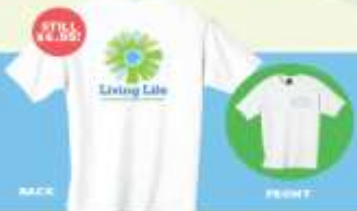
White T-shirt HANES BEEFY T 5 ® – HEAVIER THAN HEAVYWEIGHT PRODUCT #8159 M, L, XL $6.95 PRODUCT #8160 XXL $8.95 PRODUCT #8161 XXXL $9.95