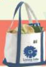
Tote Bag LENGTH 19.75", WIDTH 9"; HEIGHT 13.25" CANVAS WITH 12" REINFORCED CARRYING STRAPS PRODUCT #8165 $14.95