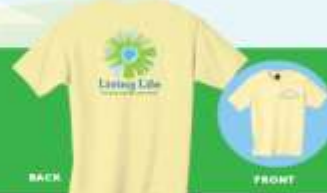
Yellow T-shirt HANES BEEFY T 5 ® – HEAVIER THAN HEAVYWEIGHT PRODUCT #8162 M, L, XL $8.95 PRODUCT #8163 XXL $10.95 PRODUCT #8164 XXXL $11.95